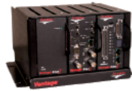
Vantage V2 Rack™

Sometimes, it is required to offer a standalone unit for data collection or connection to some other type of device such as an input to a Red Light Enforcement system where such equipment does not normally have detector racks. In these instances, many video detection manufacturers supply a standalone rack with integral power supply. The video detection processor can continue to operate in isolation collecting data and storing data until downloaded at the appropriate time.