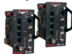
Vantage Access™ Vantage eAccess™

Communication modules are multifunction hubs providing connection to several video detection processors enabling remote access and video streaming. Communications modules provide these primary functions: